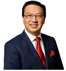
YB Dato' Sri Liow Tiong Lai Minister of Transport