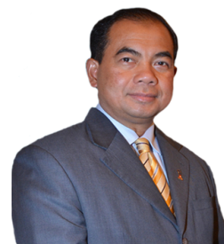
Malaysia Seafarer Day 2017 Celebration YB Datuk Ab Aziz Kaprawi Deputy Minister of Transport