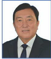
YB Dato' Seri Ong Ka Chuan Minister II, Ministry of International Trade and Industry (MITI)